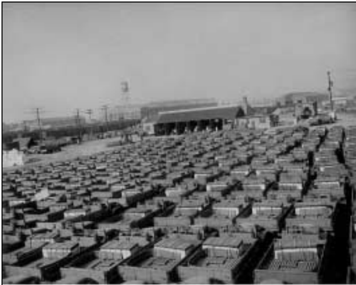
Valet parking at the front?