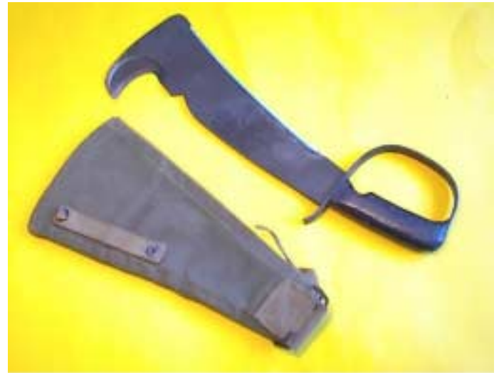
The Woodman's Pal Model LC-14-B. This model was used extensively during WWII. The knife has a parkerized blade and a hand grip made of leather washers. Inside the canvas scabbard was two pockets design to hold the user's manual and honing stone.

During the Vietnam War, the Woodman's Pal was designated the "Survival Tool, Type IV" and was issued in the aircrew survival kits. The handgrips remained made of leather washers and the blade was blued. The blade measured 10 inches long and the overall length was 14-3/4 inches, which made it smaller and shorter than the WWII Woodman's Pal. These knives were also carried in helicopters during the Vietnam War.